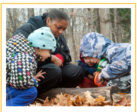
Outdoor learning occurs daily. Experiences outside encourage connections that build a sense of wonder and curiosity about the natural world.