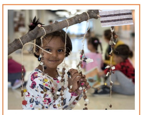
The arts allow children to express themselves in multiple ways. Exploring with various materials enhances creativity, and the development of communication skills.