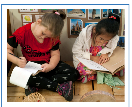
Self-regulation or social emotional learning involves communicating, reading, and writing. Through role play children build negotiation skills and empathy.

Problem-solving activities provide opportunities to explore, create, communicate, and ask questions while developing small and gross motor skills.