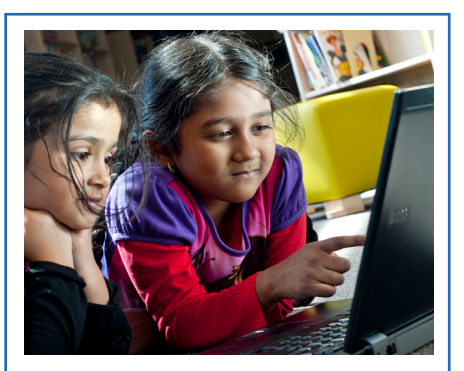
Technology is a tool children use to develop skills in designing, communicating, and researching and documenting their own learning.