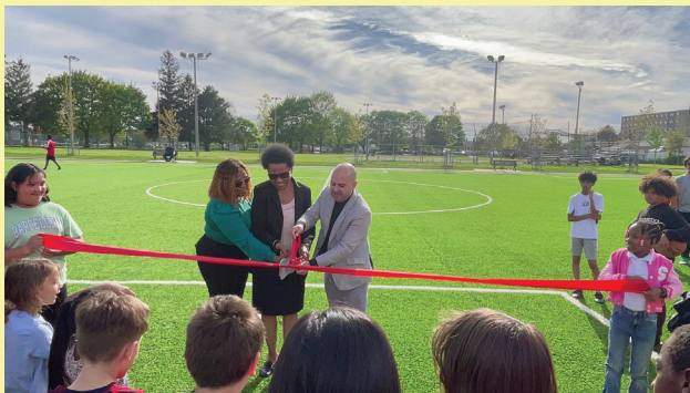
Unveiling Daystrom Public School's new artificial field.