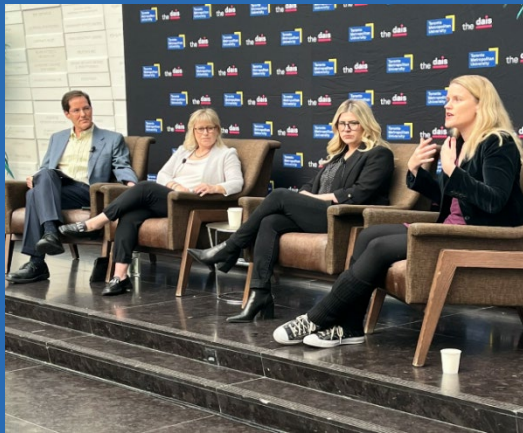
TMU DAIS Panel