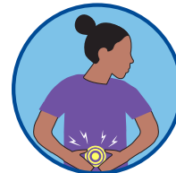
Nausea, vomiting, diarrhea