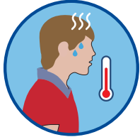
Fever > 37.8°C