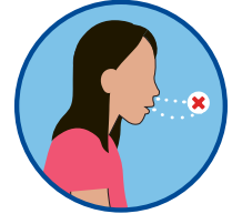
Loss of taste or smell

If "YES": Stay home, self-isolate & get tested or contact your child's health care provider.