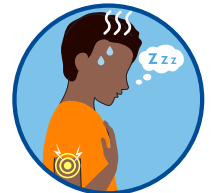
Feeling unwell, muscle aches, feeling tired