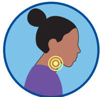
Sore throat, painful swallowing