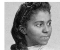
Marie Maynard Daly