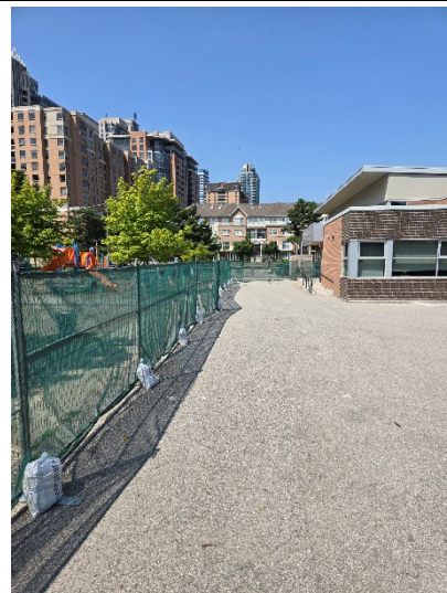
Construction fencing closing in construction area.