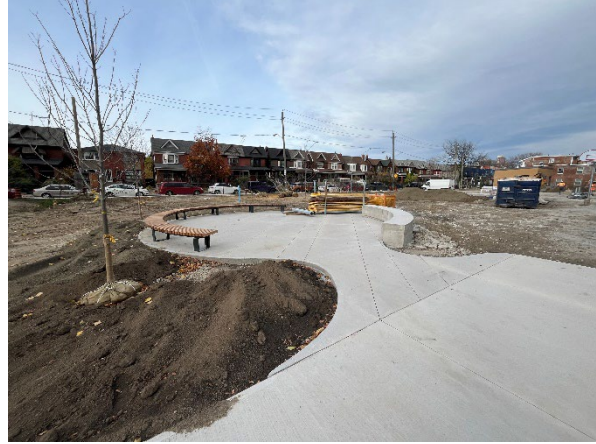
Photo of the West outdoor classroom with hardscape walkway recently poured and benches installed. Topsoil and trees are being placed.