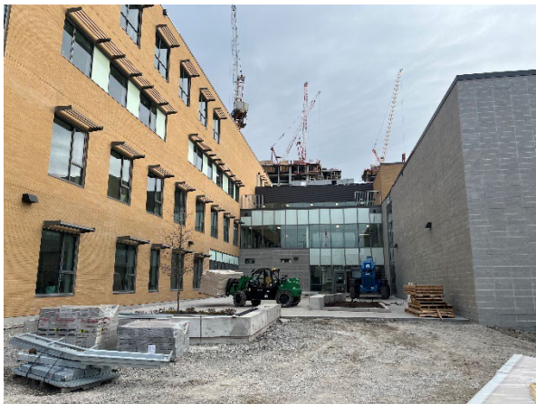
Picture of the courtyard. Window shades are installed. Concrete floor and benches have been poured. Topsoil, plants and trees have all been placed. Exterior lights are installed.