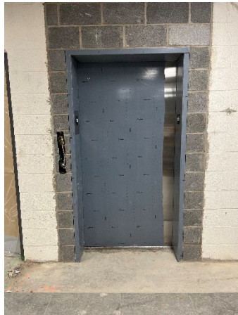
Picture of the elevator door on the ground floor. The elevator doors and frames have been installed on all floors. The rails have also been installed, and they are currently building the elevator cab.