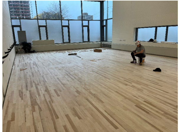
Picture of the Dance/Fitness room. The frost film on the windows have been installed, and the wood flooring is currently being installed.