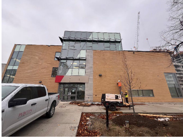
Exterior photo of the South main entrance. Exterior glazing and shade systems have been installed and metal siding was recently completed. Hardscape walkway was also recently poured.