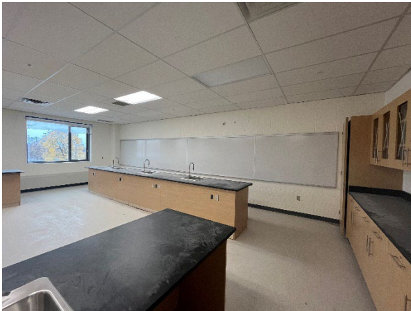
Picture of the Chemistry lab on the third floor. Millwork, countertops, and plumbing fixtures have been installed. The white boards have recently been put in place.