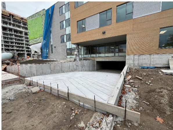
Picture taken of the ramp going down to the underground parking garage. Retaining walls and sidewalk are being completed.