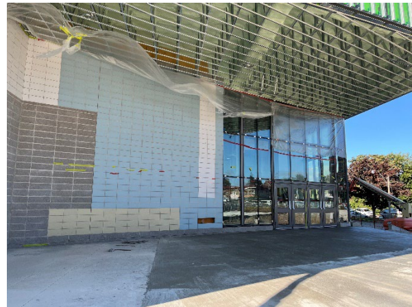
Exterior photo of the North entrance. Exterior tile is completed, and doors have been installed.