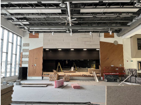
Picture of the stage in the student commons area. Porcelain tile has been installed. Railings are installed. Wood paneling is installed. Acoustic panels are installed. Stage Masonite flooring is currently being installed.