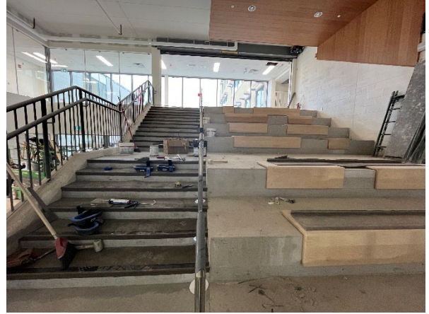
Picture of the main staircase. The wood paneling has been installed. Wood benches are placed. Railings are installed. Rubber tread flooring is currently being installed.