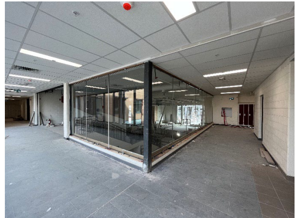
Picture of the second-floor main stair hallway. The fire rated shutter was recently completed. The interior glazing is currently underway.