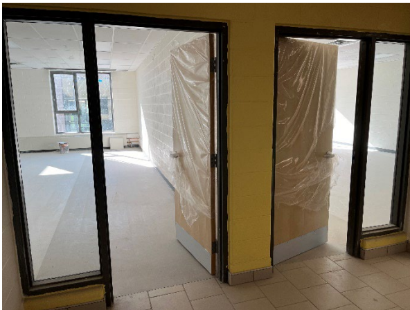
Picture of the classroom doors. Wood doors with hardware are installed. Side lites (windows) have recently been placed.