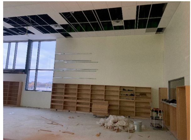
Partial picture of the library. Ceiling tile, light fixtures and vents have been installed. Installation of millwork is underway.