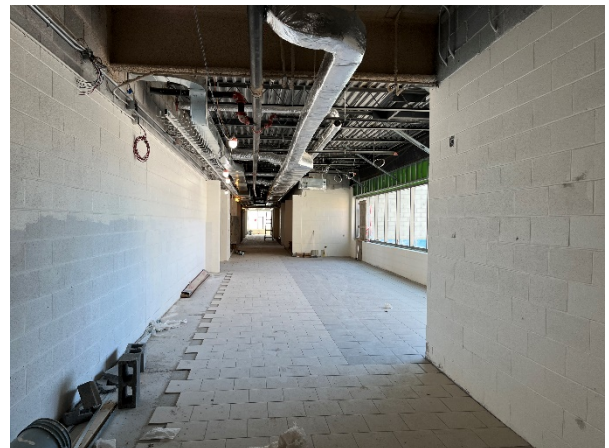
Picture of the North/South hallway on the second floor. Walls have been primed and porcelain tile was recently installed.