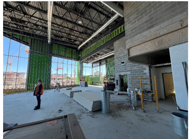
Picture of the library looking to the South. The exterior wall was recently built, and the curtainwall mullions were recently installed.