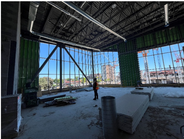
Picture of the library looking to the North. The exterior wall was recently built, and the curtainwall mullions were recently installed.