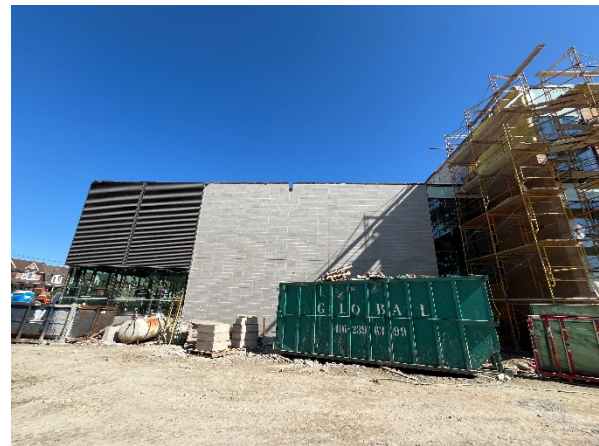
Exterior photo of the South-West corner of the building, looking at the gym. The exterior aluminum paneling was recently installed.