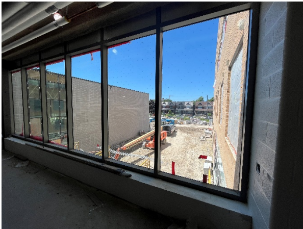
Picture looking out into the outdoor courtyard. Curtainwall glazing was recently installed, exterior block and brick veneer was recently completed.