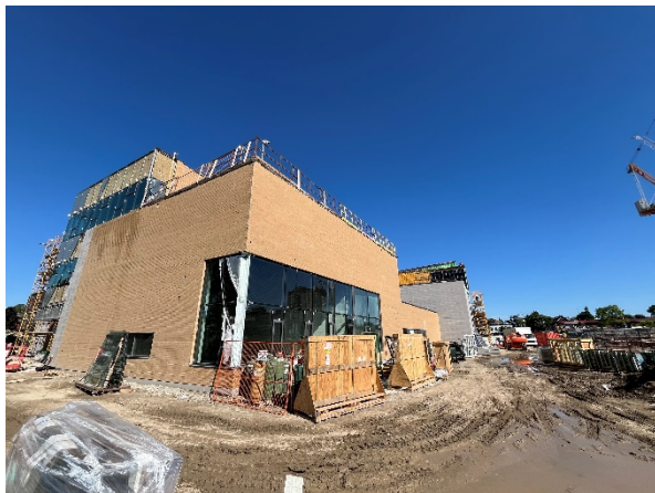
Exterior photo of the South-East corner looking at the Music Room. Parapets are built up and roof is complete.