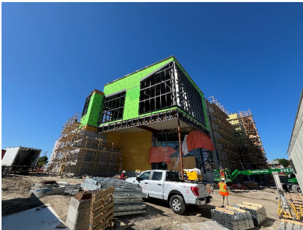
Exterior photo of the North-East corner looking at the North entrance. Third floor exterior wall has been built and mullions for glazing has been installed.