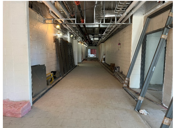
Picture looking down the North/South hallway of the first floor. Porcelain tile has been recently installed and ceiling is commencing.