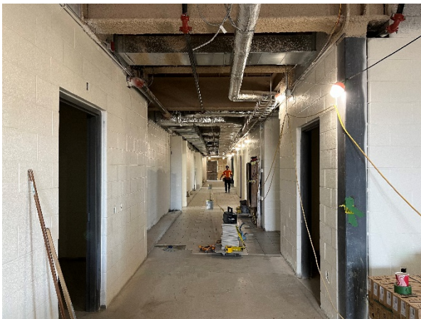
Picture of the East/West hallway on the second floor. Walls have been primed and porcelain tile was recently installed.