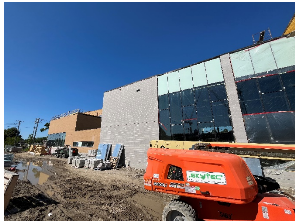
Exterior photo of the East side of the building looking towards the student commons area. Exterior block veneer and curtain wall glazing was recently completed.