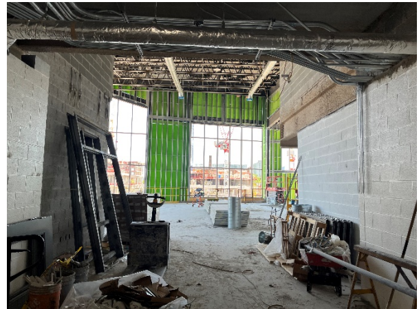
Picture from the library entrance on the third floor. The exterior wall was recently built, and the curtainwall mullions were recently installed.