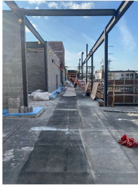
View of 3 rd floor new steel framing and block walls - ZONE A