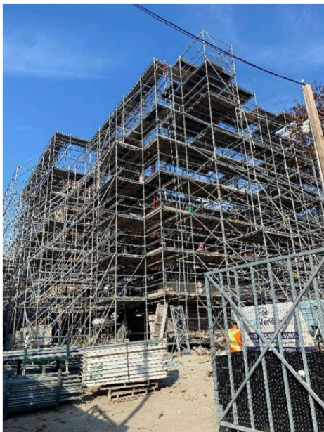
View of Scaffolding built up to the third-floor levels – ZONE A