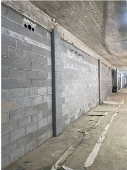
New block walls and column cover reinstatement – ZONE A