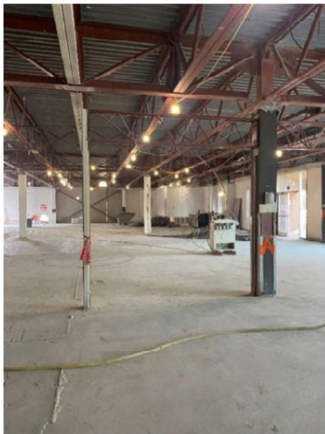
Ongoing interior demolitions – ZONE B