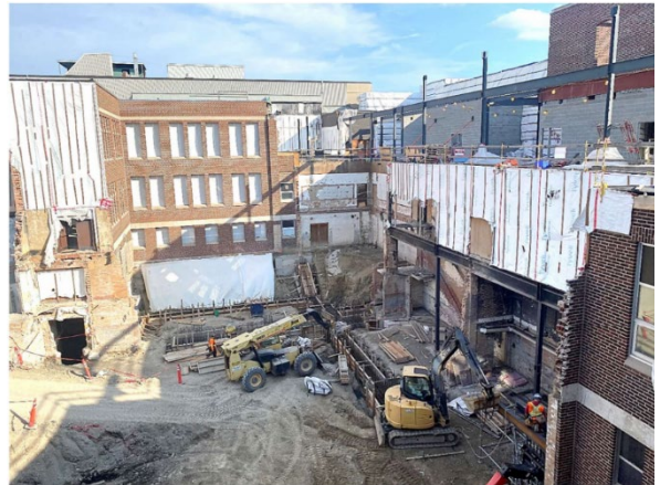
Auditorium and courtyard excavation and foundations in progress – ZONE A