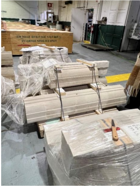
Review of salvaged stone repairs – ZONE A