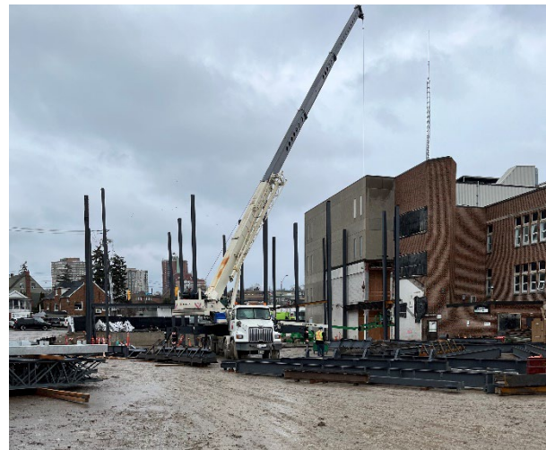
Structural Steel erection – ZONE C