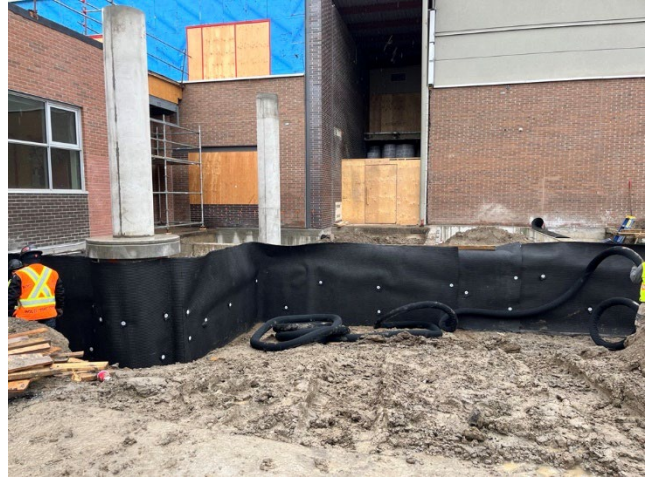
Ongoing on site foundations, footings, and column construction work.