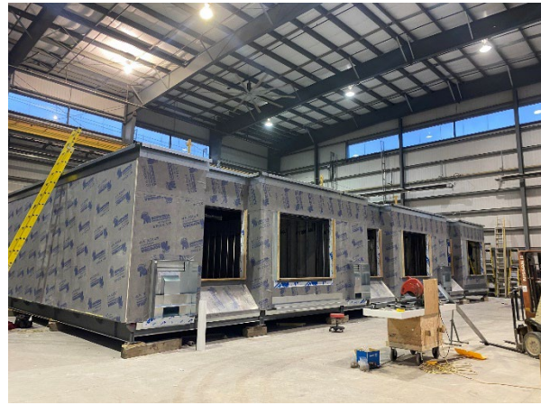
3 classrooms being constructed offsite by the Modular Manufacturer