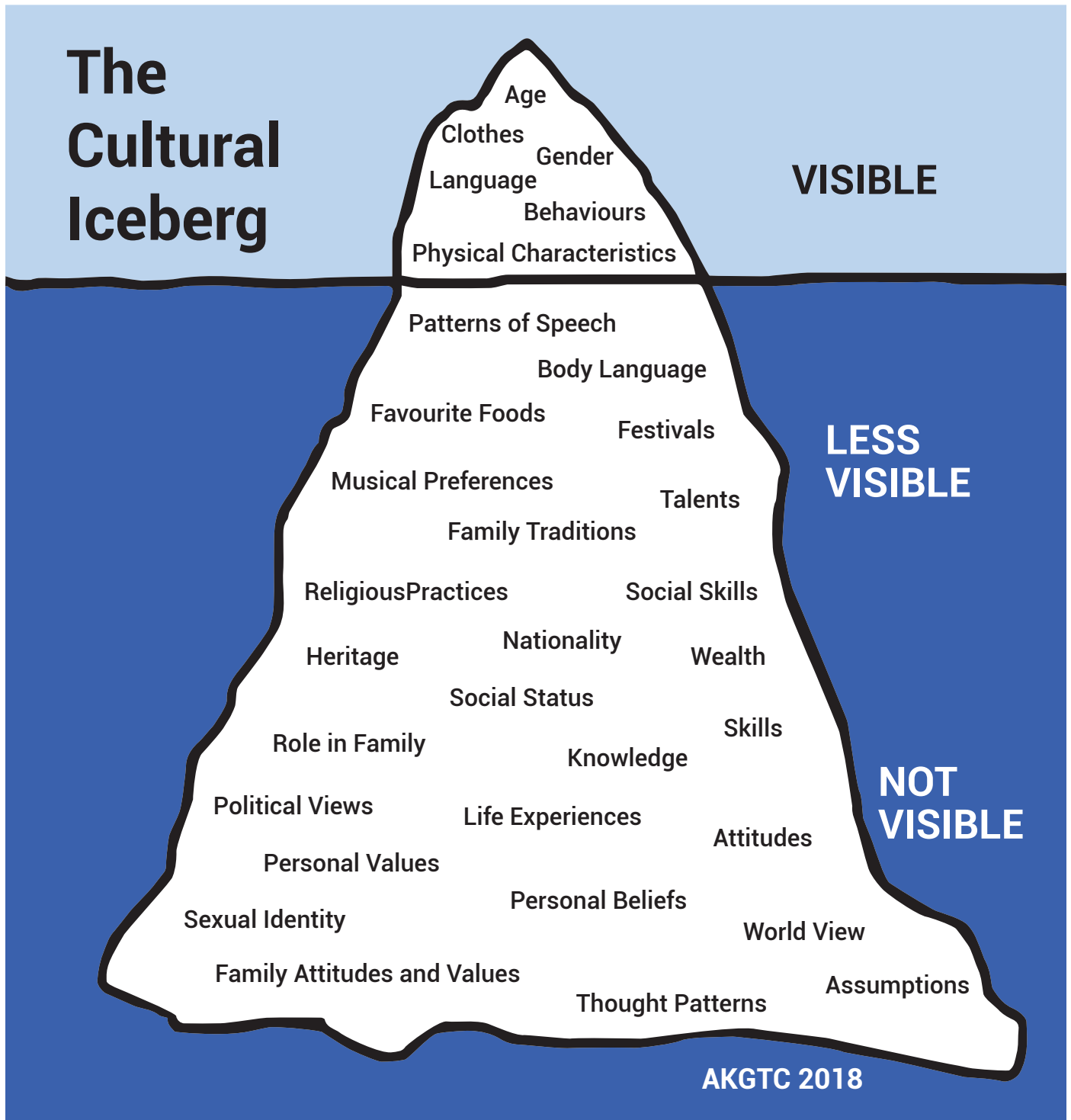
Figure 1: Sample Cultural Iceberg

Adapted from A Kid's Guide to Canada, 2017, www.akgtcanada.com/if-i-really-knew-you/ .