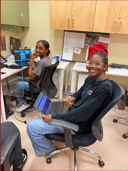
Junior leaders at TAIBU Community Health Centre