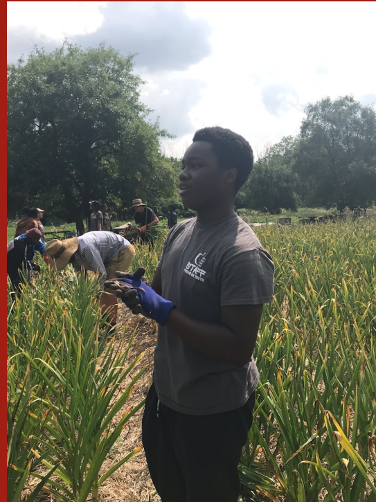
At Black Creek Community Farm doing land-based learning

Junior leaders began their placements and were welcomed by the community agencies. Each year of the Black Student Summer Leadership Program (BSSLP), we do our best to match students with experiential learning opportunities that align with their career goals and interests. For 2023, we have 20 experiential learning agencies offering placements.