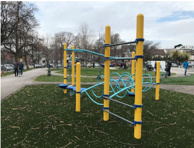
A student using play equipment with moveable features.